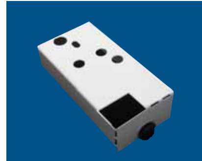
Optional End Cover